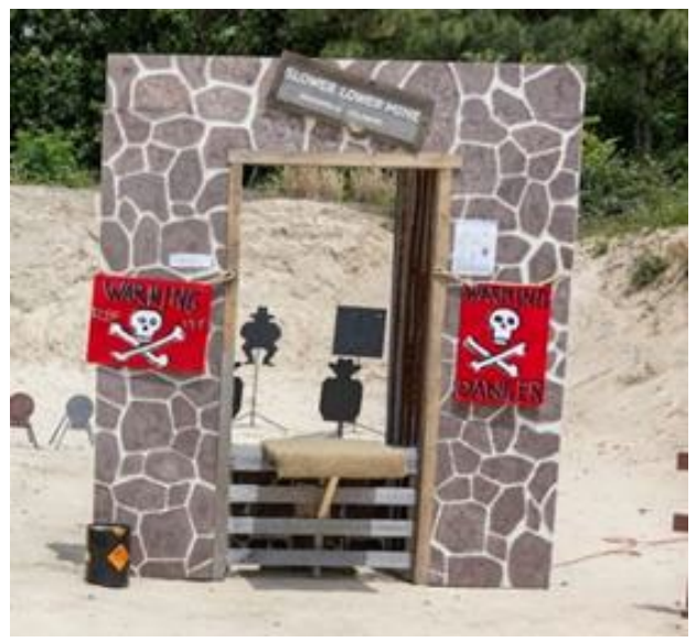
The 'Slower Lower Mine'

All the stages were based on movie scenes with an actual line from a movie used to start the bullets flying. The highlight stage was a mine shaft, named the Slower Lower Delaware mine.