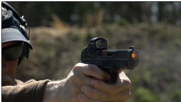
The Shadow Systems MR920L is a lot of things - but above all it's a shooter!

Shadow Systems has raised the bar considerably with the MR920L, and I presume this also applies to the other models in their catalog. The decision to include extras such as the differently angled backstraps, magwell, and all the needed parts to install nearly every brand of red-dot optic on the market is a good one. This might all be window-dressing if it weren't for the fact that the pistol is extremely well made and accurate.