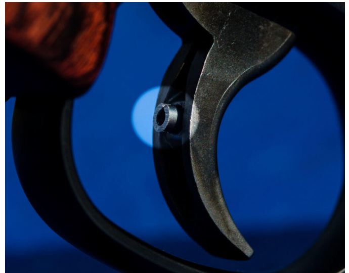
The trigger stop is not adjustable. It is a roll pin set by the Performance Center. On this copy, it is within just a few thousandths of an inch of contact.

falls. This buttery smooth double action is what Smith and Wesson built its name on. The single action is, as one would expect, very light and very crisp, with absolutely no take-up or overtravel. The latter is ensured by the addition of an overtravel stop that is non-adjustable.