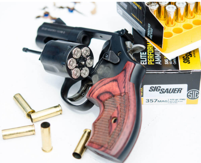
Unlike most smaller .357's, the Carry Comp remains polite to the shooter even with full power loads.

Yes, I knew that the Performance Center had ported the barrel in an effort to compensate the recoil, but I have to admit that I had no idea they'd done such a great job! Shooting full power .357 magnum loads such as SIG, Federal, and Hornady felt like – at most – .38 Special +P. I was also expecting the beautiful but quite firm and unyielding wood stocks to be uncomfortable to shoot, but here again, I was taught a lesson. The ergonomics of the custom boot grips are very good and combined with the round butt and gentle finger curves at the front, there is no slipping or jumping in the hand. They give one a confident grasp on the gun and provide excellent trigger reach.