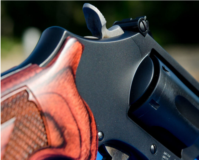
Unlike the polished and blued M19 Classic, the Carry Comp is first bead blasted to a satin surface and then blued, giving it a matte black finish.

The Model 19 Carry Comp is just small enough that it could realistically be considered for daily concealed carry, yet it's added weight and most of all, its ported barrel makes it a tame shooter, even when loaded for bear. That makes it a gun you'll enjoy shooting and practicing with. Many folks I know prefer to carry a bottom-fed semi-auto outside the home but rely on a stout revolver to protect home and hearth. This gun would be ideal for home defense duty. With the manageable recoil and smaller K-Frame, most members of the household who might need to, could handle it and deliver maximum stopping power to an immediate threat. One of the common drawbacks to a ported barrel, particularly for home defense, is the inherent muzzle flash. I watch closely for signs of excessive flash from this gun and saw none. Having a 3" barrel rather than a 2" or 1 1/2" barrel means that most of the powder is ignited before the bullet escapes the barrel, so the fire trail of burning powder that we see as 'muzzle flash' is much less. The other thing I love about the 3" barrel is the balance of the handgun. I find the Model 19 Carry Comp to be zero percent gimmick or fluff, and 100 percent serious business.