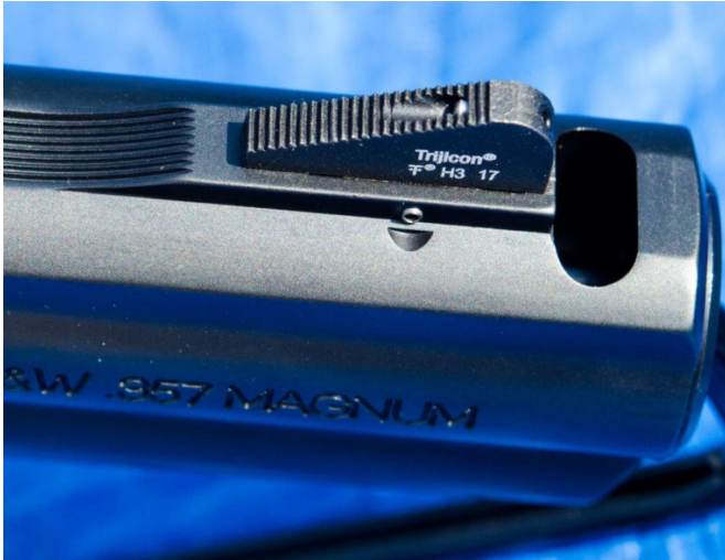
The PowerPort pushes out hot gasses to help keep the muzzle down and bleeds recoil energy. It's no gimmick – it makes a world of difference.

Yes, I knew that the Performance Center had ported the barrel in an effort to compensate the recoil, but I have to admit that I had no idea they'd done such a great job! Shooting full power .357 magnum loads such as SIG, Federal, and Hornady felt like – at most – .38 Special +P. I was also expecting the beautiful but quite firm and unyielding wood stocks to be uncomfortable to shoot, but here again, I was taught a lesson. The ergonomics of the custom boot grips are very good and combined with the round butt and gentle finger curves at the front, there is no slipping or jumping in the hand. They give one a confident grasp on the gun and provide excellent trigger reach.