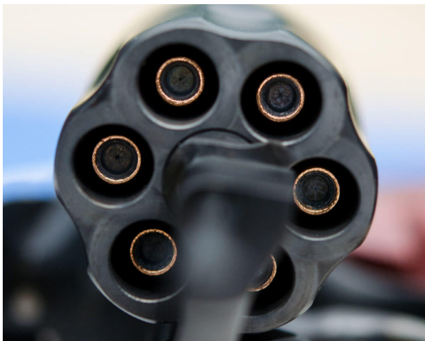
Six SIG V-Crowns, reporting for duty!

I find the Model 19 Carry Comp easy to shoot well. It's a natural pointer, has very nice sights and excellent ergonomics. This, combined with the ported barrel that not only tames recoil but reduces muzzle lift, allows you to get off several shots quickly while keeping the sights on target. Something nearly impossible to do with a traditional small .357 Mag. Of course, if you want to practice or just plink with lighter loads, you can shoot .38 Special too.