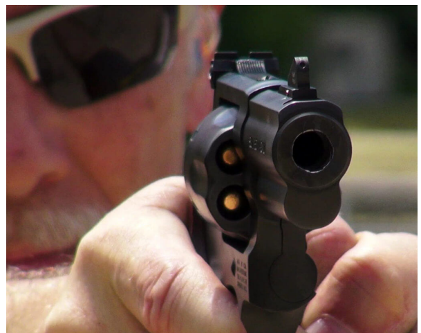
As the business end of the Carry Comp attests, this baby is strictly business.

The hammer spur is perhaps the one feature I might wish to change on the M19 Carry Comp. The PC version of the Model 19 has the more pointed spur that tends to hit me right in the inner part of my thumb's first joint and digs in. I generally prefer the more spade-style hammer spur that I believe is used on the Model 19 Classic version of the gun. That said, the hammer spur is nicely sized and very well knurled. The trigger face is smooth and the trigger shoe itself is decently radiused to provide a comfortable, smooth pull. My digital gauge concluded that the double action pulls at just under 11 lbs., and the single action at just shy of 6 lbs. I had a tough time buying those results and re-tested several times because those numbers belie the smooth and lighter feel.