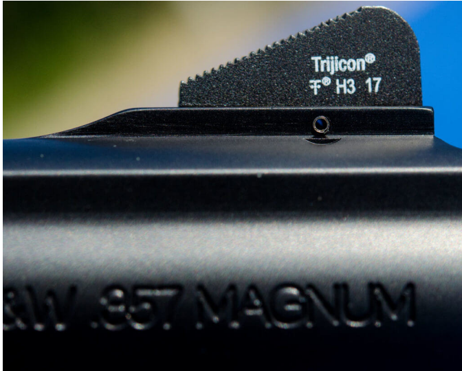
The front sight is tall with anti-glare serrations and a Tritium dot.

nicely serrated front sight blade, a trigger overtravel stop, and of course – the very nicely PC tuned action. The attention was paid to improving the performance of the revolver and not just at adding bling. In fact, aside from the gorgeous wood stocks and the Performance Center roll mark on the barrel and medallion on the frame, the gun is very ordinary looking at first glance.