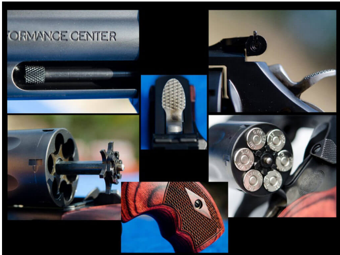
The fit and finish of the M19 Carry Comp is everything you'd expect from the Performance Center.

The rear sight is fully adjustable, and my copy of the Carry Comp was printing about a foot low inside 20 yards. The sight was set all the way down, so after some adjusting, I got the groups where I wanted them. This caused me to wonder if the sight is not deliberately set low to prevent damage to it in transit and handling. The front sight is high and the ramp is nicely serrated, like the steps of a Mayan temple. Inlaid at the altar of that temple is a small vial of Tritium® that provides a nice pinpoint sight in daylight or in total darkness.